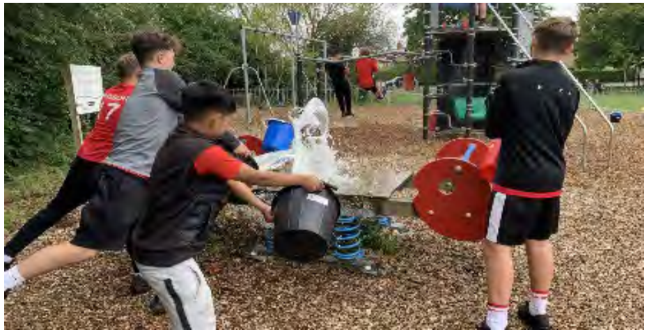
Our Playground Project Year 9s spreading the new bark and cleaning the playground equipment at Swavesey Recreation Ground.