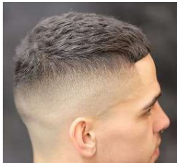
Less than a #2 cut.