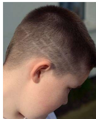
Tram lines shaved into hair.