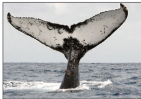
A whale's tail

Whales are amazing creatures who live in the ocean. They may look like fish, but they are mammals. Using a blowhole on the top of their head, whales breathe air into their lungs. Despite their large size, whales can move quickly by moving their tail up and down. Did you know that each of their tails is unique just like our fingerprints?