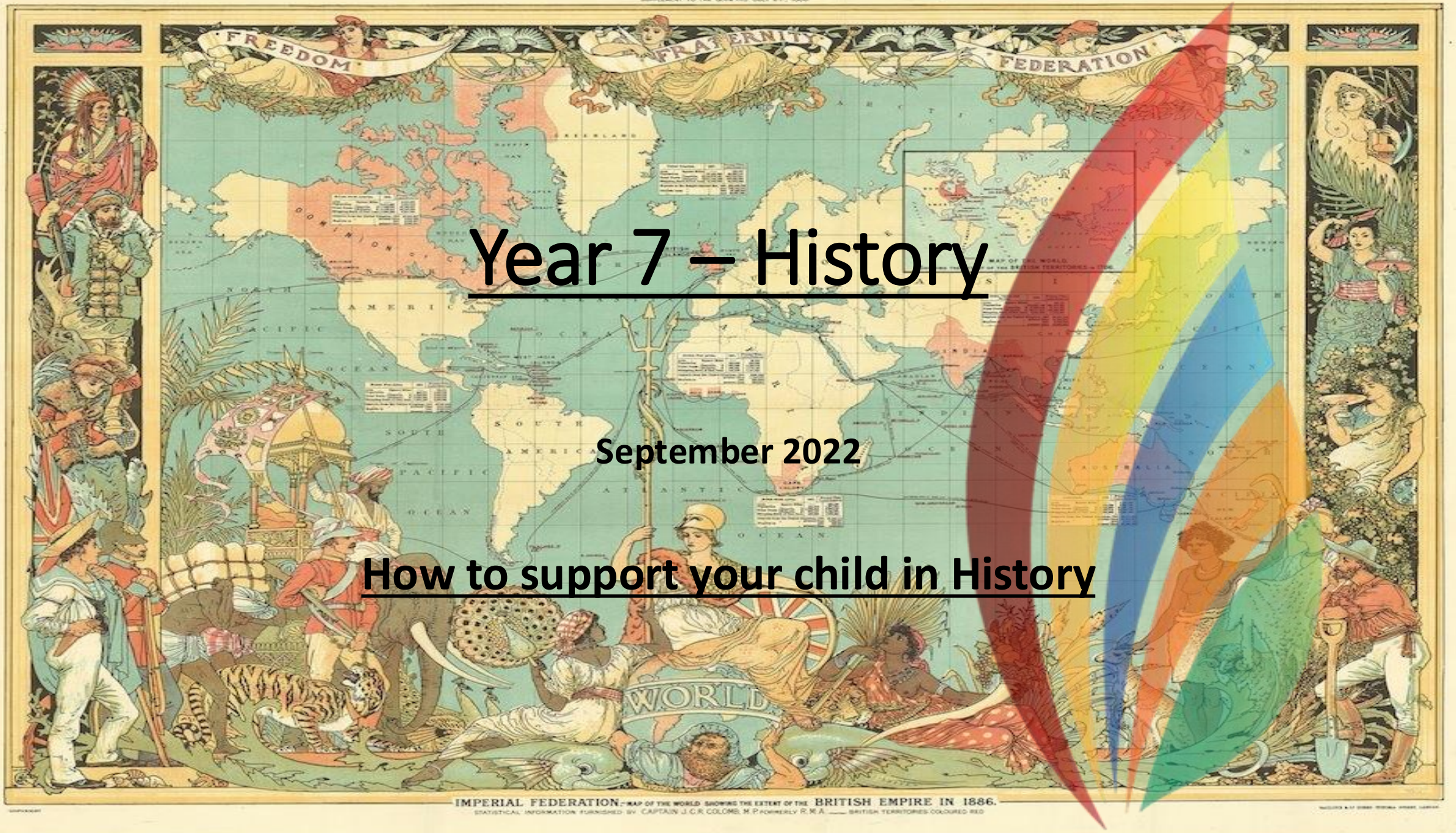
IMPERIAL FEDERATION.—MAP OF THE WORLD SHOWING THE EXTENT OF THE BRITISH EMPIRE IN 1886. STATISTICAL INFORMATION FURNISHED BY CAPTAIN J. C. R. COLOMB, M. P. FORMERLY R. N. A. BRITISH TERRITORIES COLOURED RED.