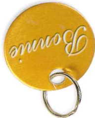
a name tag