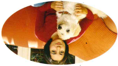
someone to love them